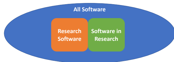
FIGURE 1. Segmentation of all software, research software, and software in research. In the present paper, we further categorize the orange box, i.e., research software.

Research software can be used to collect, process, analyze, and visualize data, as well as to model complex phenomena and run sophisticated simulations. Research software is also developed to control and monitor lab experiments and environmental observations. In engineering research, research software constitutes a new paradigm of scientific inquiry next to theory and experiment [11], and acts as a proof-of-concept