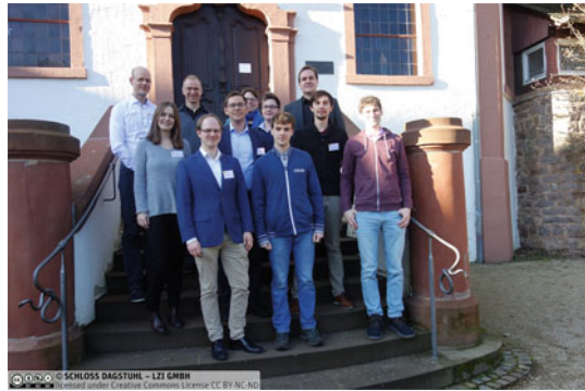
Fig. 4 The nominees and the committee in Dagstuhl 6

All nominated candidates and especially the winning person (or group) are invited to summarize their work in this book.