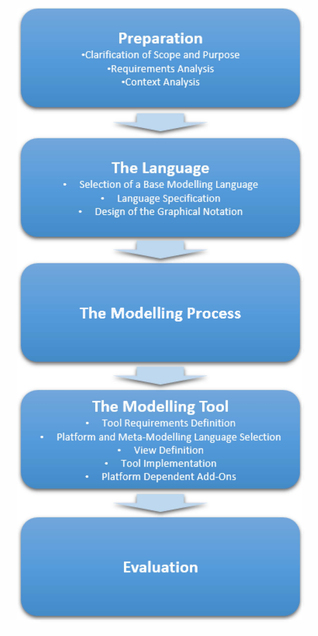
Fig. 2: The DSMM-creation process

We propose to divide the creation process in five main phases (see Fig. 2): Preparation, Modelling Language, Modelling Process, Modelling Tool and Evaluation. Each phase consists of several steps which are inspired by the work of [11] and [12] as mentioned before. The following chapters will motivate and explain each phase in detail: